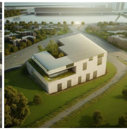
(e) Architectural designs